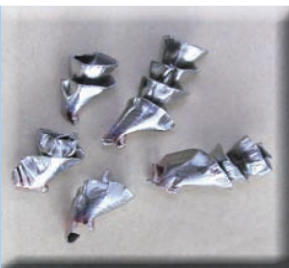
Company A's chips